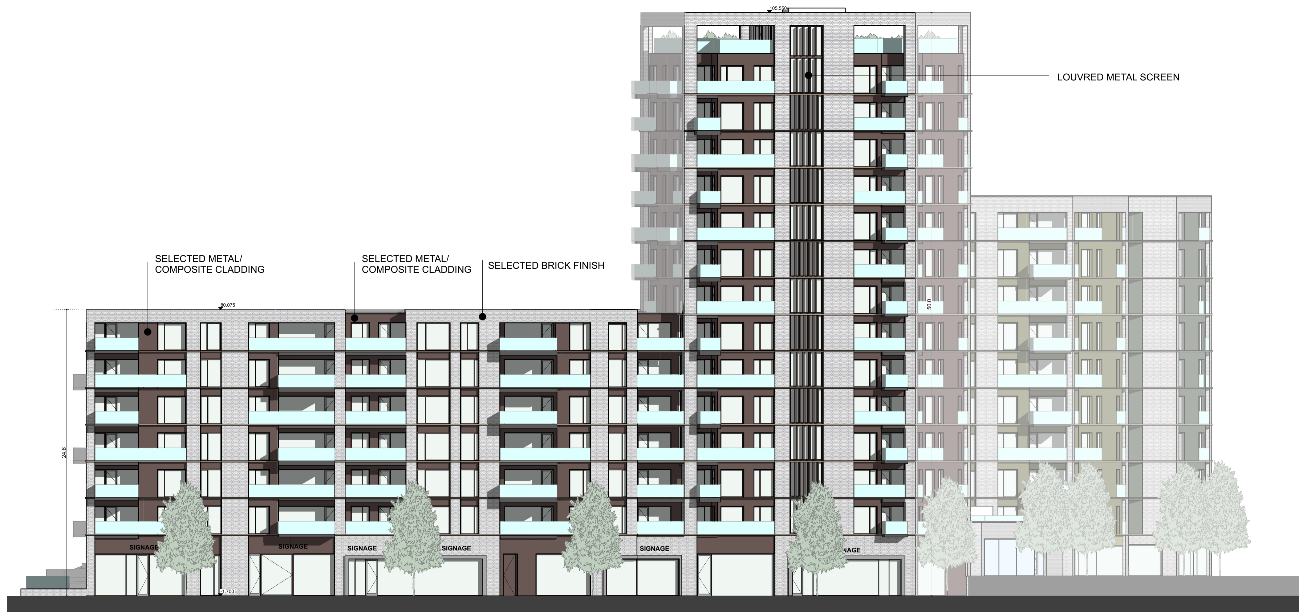
Elevation A-A SCALE : 1:200