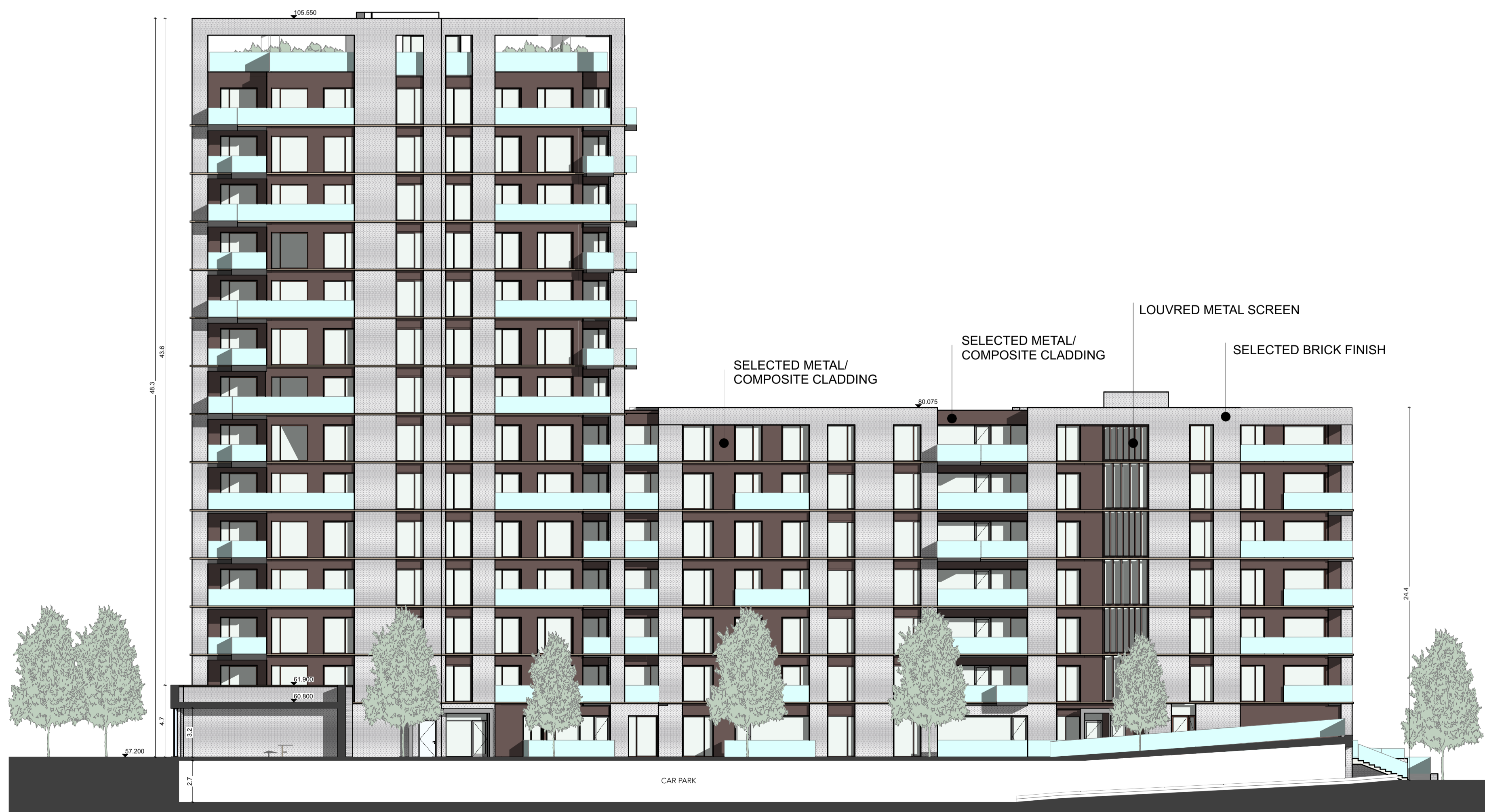
Elevation B-B SCALE : 1:200

NOTES WALL FINISHES TO BE BRICK/METAL/COMPOSITE CLADDING AS INDICATED. ROOFS TO BE GREEN ROOF TYPE. BALCONIES TO BE GLAZED.